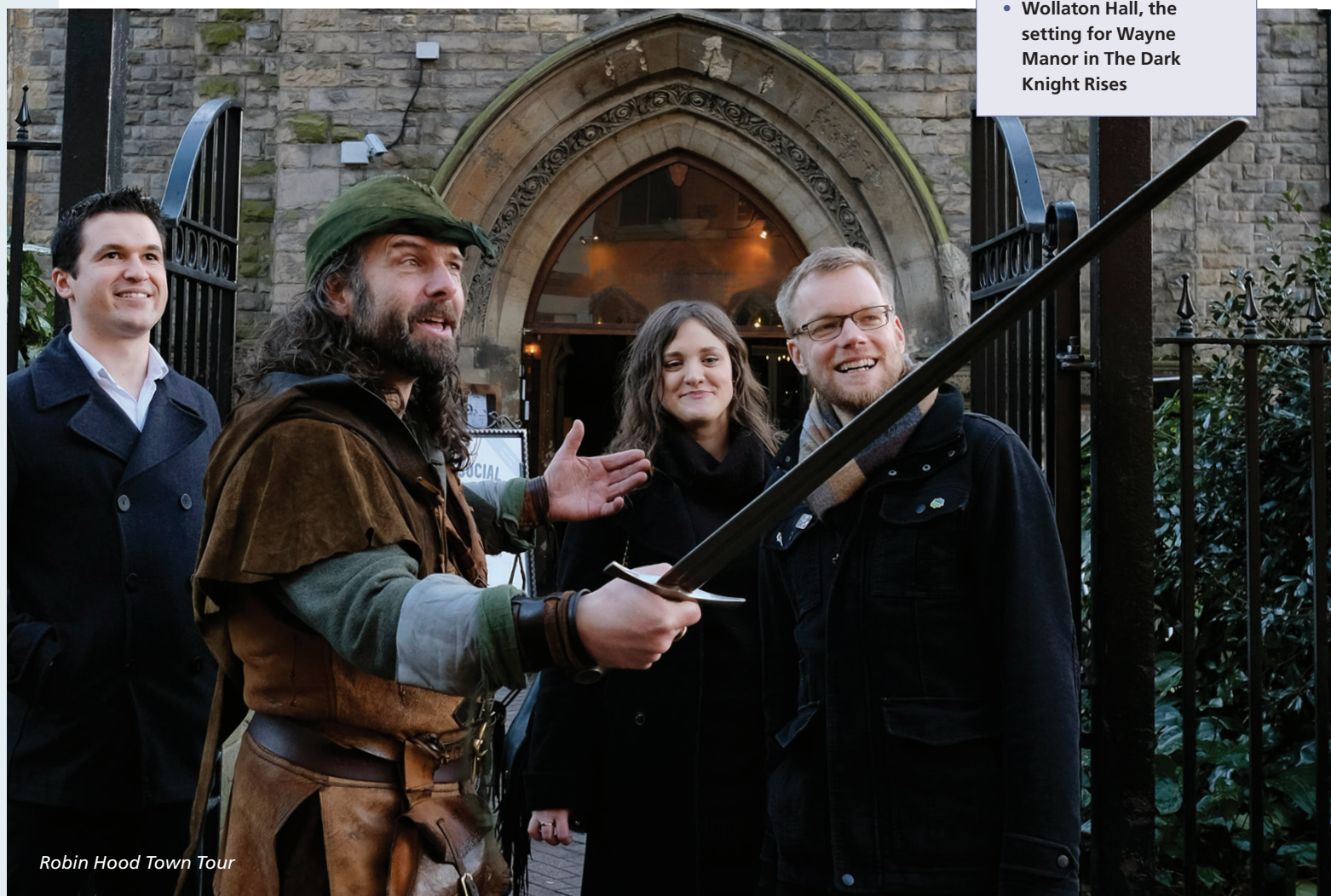
Robin Hood Town Tour