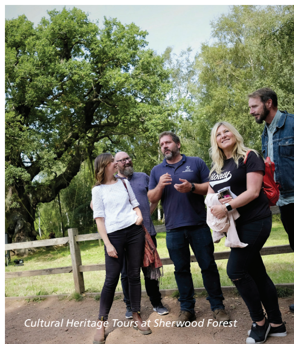
Cultural Heritage Tours at Sherwood Forest