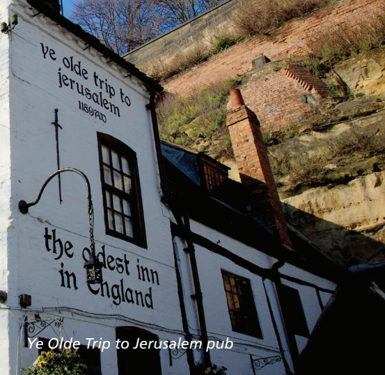
Ye Olde Trip to Jerusalem pub