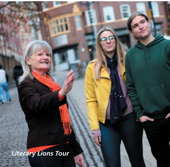
Literary Lions Tour