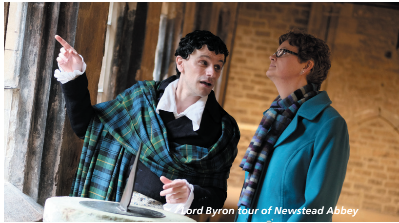
Lord Byron tour of Newstead Abbey

Newstead Abbey – Nottingham 11.5 miles | 30 mins