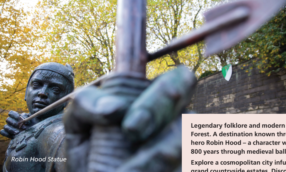
Robin Hood Statue

Legendary folklore and modern charm collide in Nottingham and Sherwood Forest. A destination known throughout the world as the home of outlaw hero Robin Hood – a character whose well-loved tale has been retold over 800 years through medieval ballads, literature, television, film and theatre.